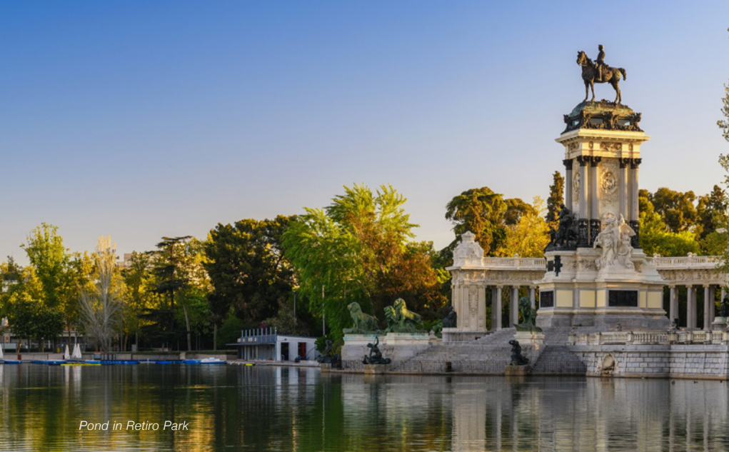
Pond in Retiro Park