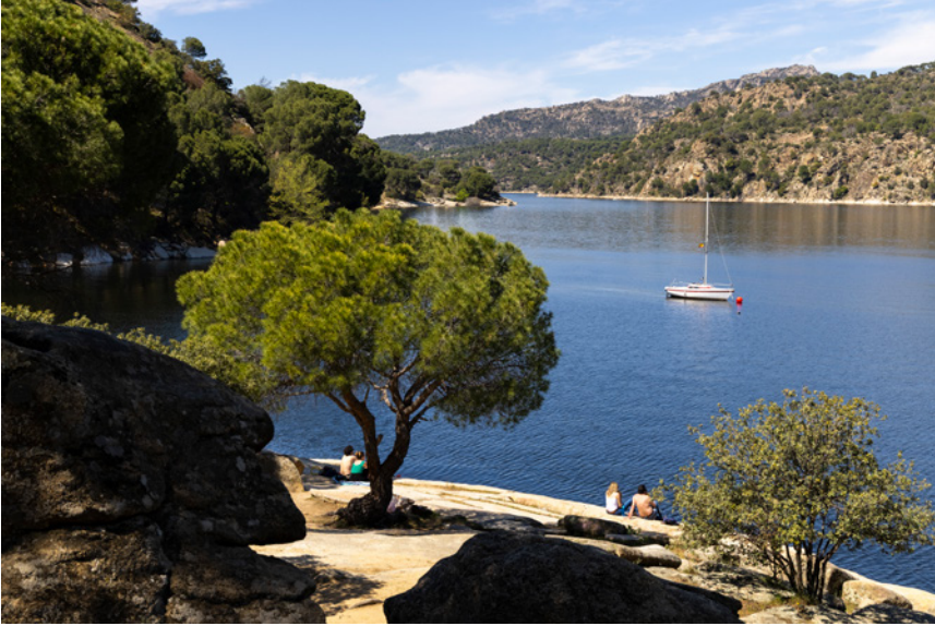
San Juan Swamp

If you are a fan of wine tourism, come here to also enjoy its landscape and heritage. From the Keep of the historic Castle of La Coracera, there are wonderful views of the Gredos Mountain Range and the mantle of forest covering Madrid's Sierra Oeste. But there is more: the reservoirs of San Juan and Picadas are our very own seas in which to enjoy a summer's day, with many nautical sports and nature activities.