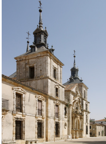
Goyeneche Palace facade in Nuevo Baztán