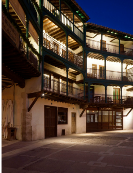
Plaza Mayor of Chinchón