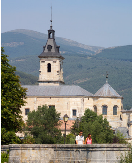
Royal Monastery of Santa María de El Paular