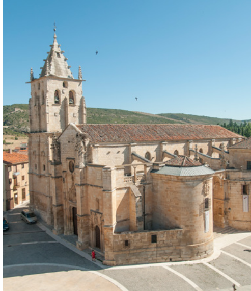
Church of Santa María Magdalena in the Plaza Mayor of Torrelaguna