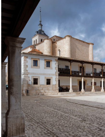
Plaza Mayor. Colmenar de Oreja

restore energy after losing oneself in streets packed with history. Its castle affords the best panoramic views of Chinchón.