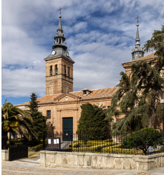
Church of Nuestra Señora de la Asunción. Navacarnero