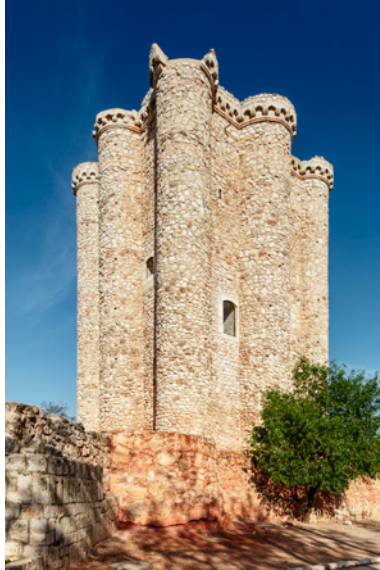
Castle of Villarejo de Salvanés

Madrid's gothic architecture, El Pósito public granary, the old Hospital of La Santísima Trinidad, today the House of Culture, and the Franciscan Convent of La Madre de Dios.