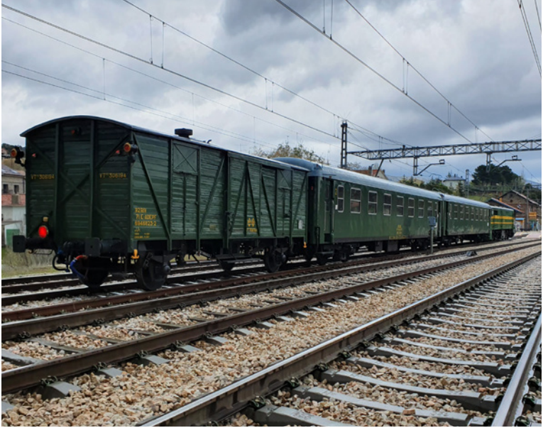
Tren de Felipe II

The Royal Site of San Lorenzo de El Escorial, a colossal building built in the middle of Guadarrama mountains was the best destination for 19th century travellers in love with adventure and mystery with a romantic perspective. The Tren de Felipe II is ideal to experience that kind of excitement