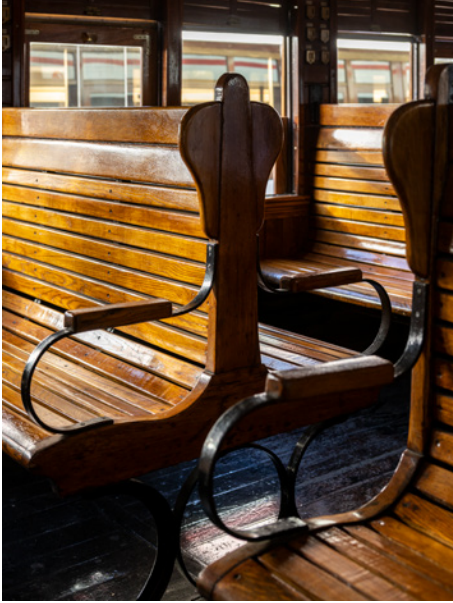
Tren de la Fresa