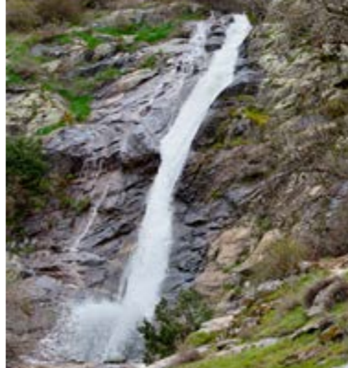
>>> Ravines of el Pontón de la Oliva.