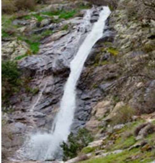
>>> Ravines of el Pontón de la Oliva.