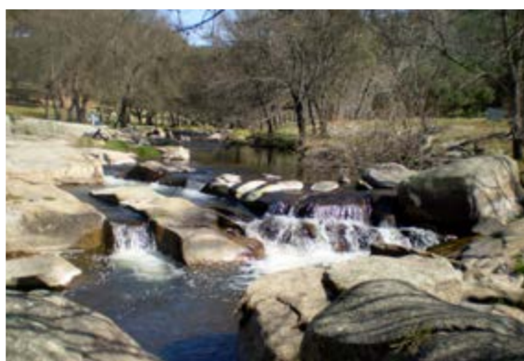
< Cofio River Route.

In our region, there are five officially registered bathing areas, where water quality is monitored periodically throughout the summer. The following bathing areas are monitored for water quality: Las Presillas, Los Villares, El Muro, Virgen de la Nueva and Playa del Alberche.