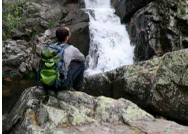
< The Purgatorio waterfall.