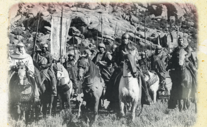
El Cid . Manzanares el Real.