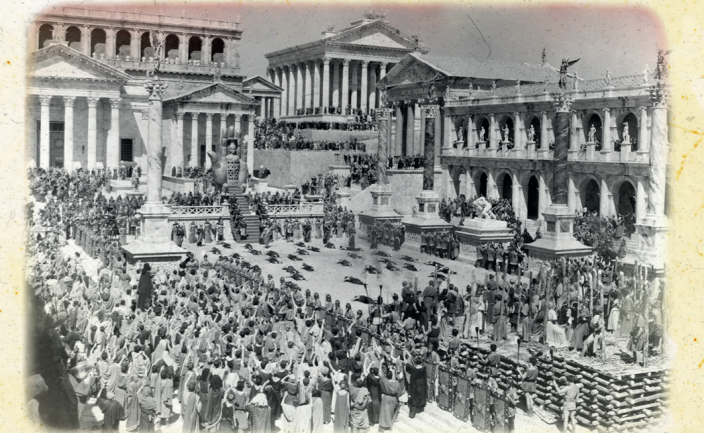
The Fall of the Roman Empire . Las Rozas.

The largest film studios in Madrid in the late fifties and early sixties, Sevilla Films, CEA and Chamartín, later known as Bronston, were lavishly decorated with castles and palaces. And in the shadow of that film empire, its resources were used for other productions, such as Savage Pampas or Dr. Coppelius , which counted with the participation of other important names such as Robert Taylor, Walter Slezak, Paul Naschy or Michael Rennie, filmed in Boadilla del Monte, Villamanta or San Martín de Valdeiglesias.