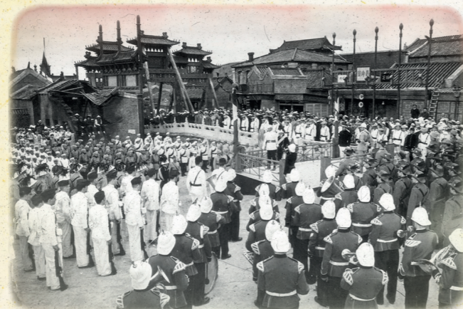
55 Days at Peking . Las Rozas.