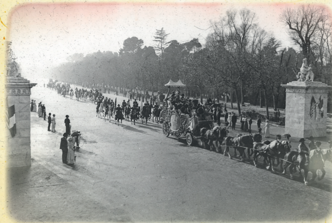
Circus World . El Retiro Park.

Bronston's productions immortalised Madrid's landscapes in some of cinema's most memorable epics such as Captain Jones , King of Kings , El Cid , 55 Days at Peking , The Fall of the Roman Empire and Circus World . The Plaza de Chinchón, La Pedriza in Manzanares el Real, the Alberche beach in Aldea del Fresno, the mountains of Navacerrada or La Cabrera, the Ermita de los Remedios in Colmenar Viejo, the Royal Palace in Aranjuez, or sites in the capital city itself, such as El Retiro or the Royal Palace, became the scenes of duels, battles and passionate love affairs.